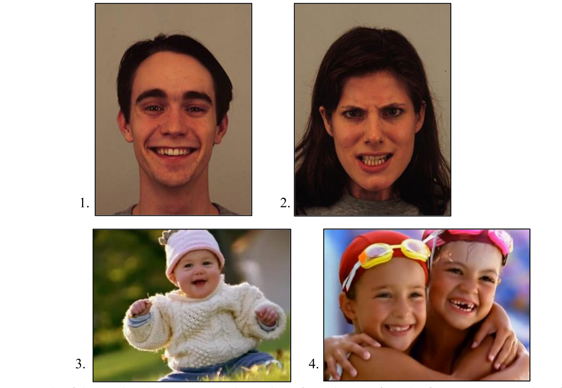
Fig. 1. Examples of photographs in the Static Faces paradigm: (1) happy face and (2) angry face (taken from KDEF; [25]). Screenshots of video clips in the Dynamic Social Information paradigm: (3) single face and (4) multiple faces

29.73° visual angle were presented in an alternate order (i.e., single, multiple, single, multiple, single, multiple). In each trial, a video clip was presented to the child. In the single face condition, one face of a child was on the screen; in the multiple faces condition, two or more faces were on the screen (child-child, child-adult, or child-adult-adult). The video clips consisted of subjects with different cultural backgrounds and were extracted from the TV broadcasted series "Baby Einstein" ([22]; see Fig. 1). The videos were accompanied by unsynchronized classical instrumental music, and no speech was involved. As these eye tracking paradigms did not involve language and used age-appropriate stimuli, it was considered to be appropriate for participants in both countries. In a group of non-clinical young children aged 3–7 years, this eye tracking paradigm was found to be significantly predictive of real-life social behaviors, and independent of age, IQ, or gender [46].